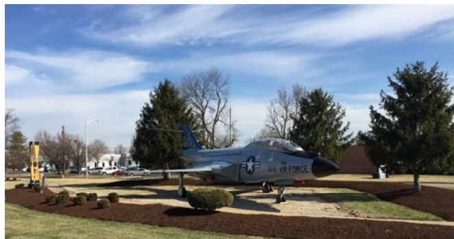
VOODOO AT SPIRIT AIRPORT 03/02/2018

First flight: September 29, 1954 (F-101A) Power: Two Pratt & Whitney 6749kg/14,880 lb after burning thrust J57-P-55 turbojet engines Armament: Two MB-1 Genie nuclear-tipped air-to-air missiles and four Falcon air-to-air missiles or six Falcon air-to-air missiles Size: Wingspan 12.09/39ft 8in Length—20.54m/67 ft 4.75 in Height—5.49m/18ft Wing area—34.19m 2 /368 sq ft Weights: Empty—13,141kg/28,970 lb Maximum take-off—23,768kg/52,400 lb Performance: Maximum speed 1,965 kph/1,221 mph Ceiling 16,705m/54,800 ft Range 2,494km/1,550 miles Climb 11,133m/36,500 ft per minute