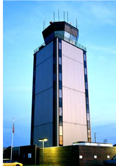
Spirit Airport Control Tower Today Built in 1984